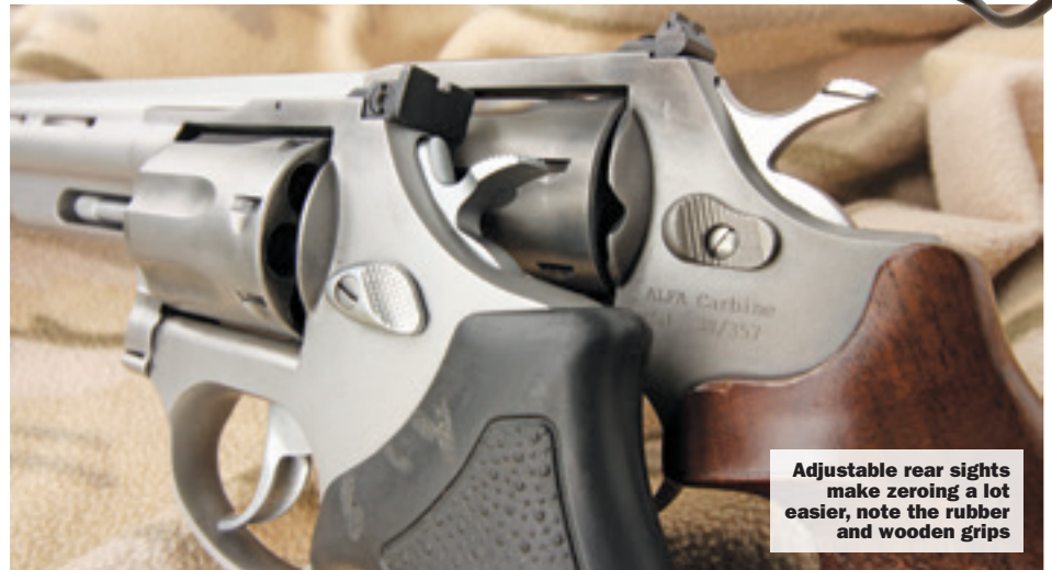
Adjustable rear sights make zeroing a lot easier, note the rubber and wooden grips

Drills are different for an LBR, particularly as you can't use the normal 0/90 'fumble zone' for loading and unloading an LBP. Why? Loading and unloading is done with the barrel up and down as I've explained. However, any revolver is rendered instantly safe as soon as the cylinder is opened, but