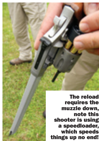
The reload requires the muzzle down, note this shooter is using a speedloader, which speeds things up no end!